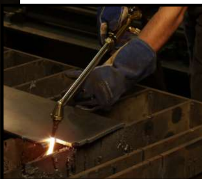
Model MK-300 shown cutting with 75° head