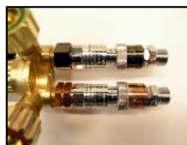
Koike cutting tips

Custom Regulators - Koike's 101 single-stage oxygen regulator and 202 single-stage acetylene and 206 LPG regulators meet the industry needs for safety, reliability and economy. Assure your cutting, welding and heading operations to be safe and effective with Koike custom regulators.