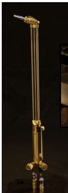
Model MK-250 shown with 75° head