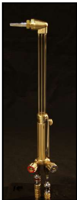
Model MK-150 shown with 90° head